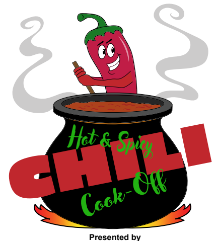
Denham Springs Main Street

Deadline for Name recognition Sponsorships October 6, 2024